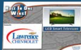
LED Television Bonus Prize